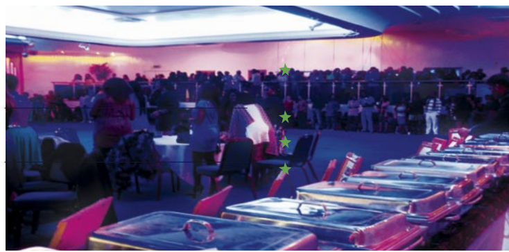
[Above] Catering Unit and layout logistic(s) - Ilford. Zambian 48th Independence Dance, October 28th 2011. En Masse: 1,000 People, catering 24 dishes. Served on average 520 meals. Style: traditional Zambian cuisine by HC Business Member: Fredor Restaurant. Critical Mass: Buffet Style

there necessarily to be 'won over'. The HC can provide food or 'manage' assigned assets already provided. (i.e You are a catering Company or own a restaurant and produce your own menu). See other things that the HC can do as part of HC Basic Events Management service: