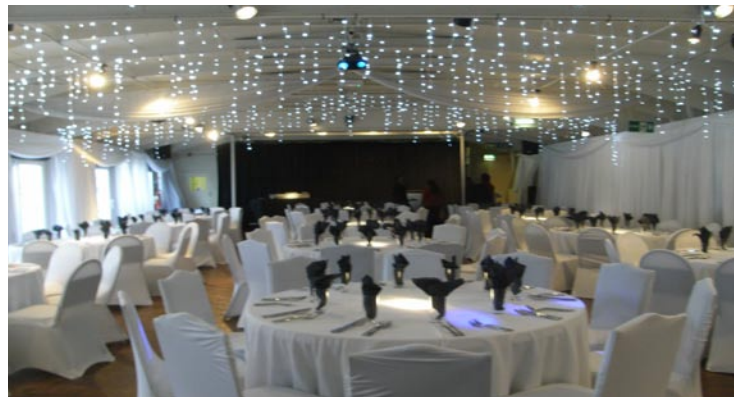
[Above] Interior decoration and logistic(s) - HMS President Ship, 1918. The Merit Awards For Excellence October 9th 2010. En Masse: 250 People, catering 4 course meal with traditional Nigerian cuisine. Critical Mass: Buffet Style

The feedback has been positive, and this kind of investment in Management for Cultural Events serve not only the 'host' and 'organisers', but also protects Revenue of Sales made. It also increases sales, because you put yourself "behind the necessary mechanisms of making money". Punters are less likely to cause arguments, because you are not